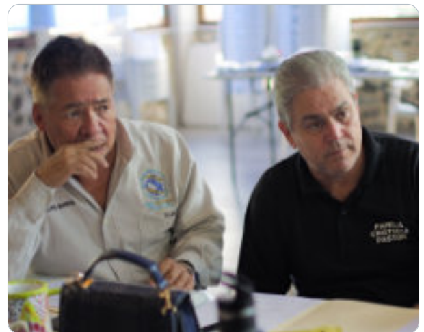
▲ FAM Assembly in Guatemala