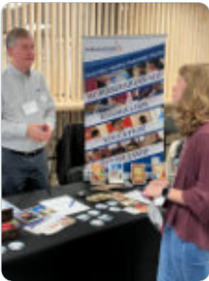
CIU Mission's Week ▲

Greetings and thanks to all of you who pray for us and this ministry. We would like to report that God answered many of your prayers this past winter. He went before us in planned travel to South Carolina, Guatemala and Japan. May we share some of the details with you? I hope this will encourage each of you.