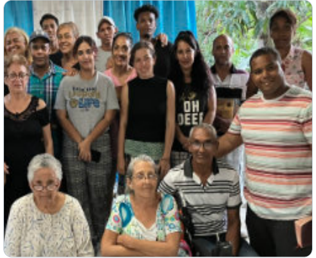
A new member of God's family ▼