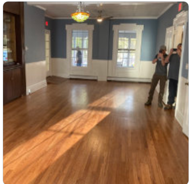
▲ Refinished wood floor in parlor at the mission headquarters